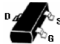
SOT-23 top view