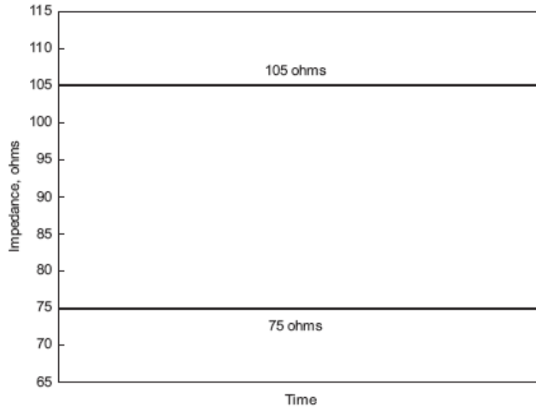
Figure 1 Impedance Limits of a Mated Connector