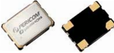
7.0 x 5.0mm Ceramic SMD