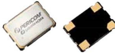
7.0 x 5.0mm Ceramic SMD