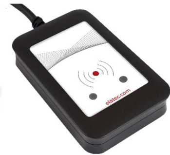
Desktop version (inlay customizable)

Elatec's TWN4 family of transponder readers and writers allows users to read and write to almost any 125 kHz, 134.2 kHz and 13.56 MHz tags and/or labels. It supports all major transponders from various suppliers like ATMEL, EM, ST, NXP, TI, HID etc. and ISO standards like ISO14443A/B (T=CL), ISO15693, ISO18092 / ECMA-340 (NFC).