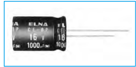
Marking color : Gold print on a black sleeve