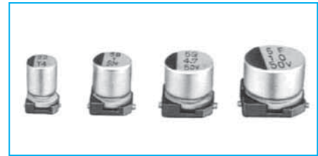
Marking color : Black print