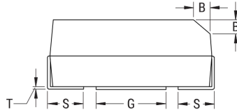
ANODE (+) END VIEW