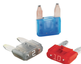
MINI Style Fuses