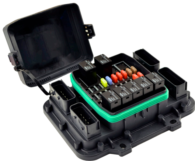
*Fuses and Relays Not Included