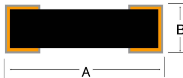
TABLE I. DIMENSIONS: