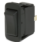
Rocker Switch 58311 Series