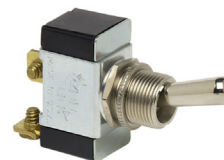
Toggle Switch Standard Heavy Duty Series