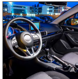
Automotive Interior Lighting