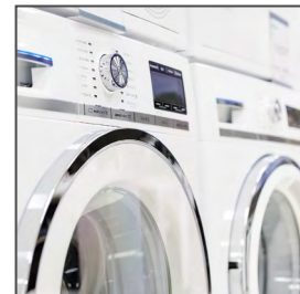
Washers and Dryers