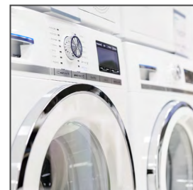
Washers and Dryers