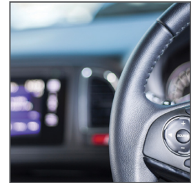
Steering Wheel Switches