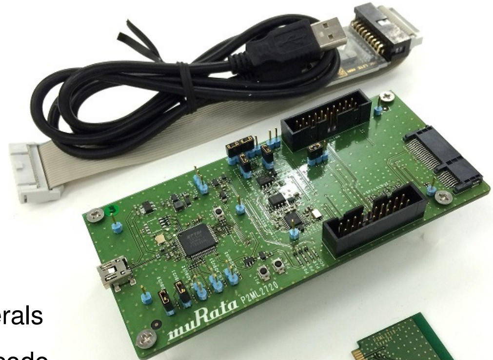
Design Kit Motherboard