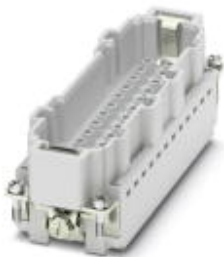
HEAVYCON pin insert, for 830 V (III/3), with 10 N/O contacts and 2 switch contacts, crimp connection

Please be informed that the data shown in this PDF Document is generated from our Online Catalog. Please find the complete data in the user's documentation. Our General Terms of Use for Downloads are valid ( http://phoenixcontact.com/download )