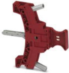
Test plug, Number of positions: 1, Width: 9 mm, Color: red

Please be informed that the data shown in this PDF Document is generated from our Online Catalog. Please find the complete data in the user's documentation. Our General Terms of Use for Downloads are valid ( http://phoenixcontact.com/download )