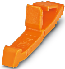
Latching, length: 29.8 mm, width: 4.4 mm, number of positions: 1, color: orange

Please be informed that the data shown in this PDF Document is generated from our Online Catalog. Please find the complete data in the user's documentation. Our General Terms of Use for Downloads are valid ( http://phoenixcontact.com/download )