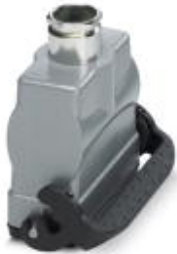
HEAVYCON B16 coupling housing, with single locking latch, height: 82 mm, with 1 x Pg21 screw connection, straight cable outlet

Please be informed that the data shown in this PDF Document is generated from our Online Catalog. Please find the complete data in the user's documentation. Our General Terms of Use for Downloads are valid ( http://download.phoenixcontact.com )