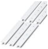
Zack marker strip, Strip, white, Unlabeled, Can be labeled with: Plotter, Mounting type: Snap into tall marker groove, For terminal block width: 15.2 mm, Lettering field: 10.5 x 15.1 mm

Zack marker strip - ZB 15:UNBEDRUCKT - 0811972