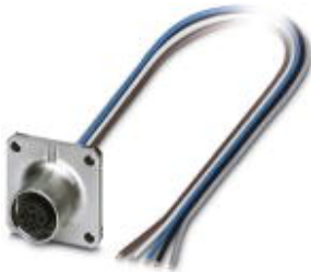
Sensor/actuator flush-type socket, 5-pos., M12, B-coded, front/square flange mounting, with 0.5 m TPE litz wire, 5 x 0.34 mm 2

Please be informed that the data shown in this PDF Document is generated from our Online Catalog. Please find the complete data in the user's documentation. Our General Terms of Use for Downloads are valid ( http://download.phoenixcontact.com )