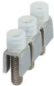
Fixed bridge, Number of positions: 3, Color: silver

Please be informed that the data shown in this PDF Document is generated from our Online Catalog. Please find the complete data in the user's documentation. Our General Terms of Use for Downloads are valid ( http://download.phoenixcontact.com )