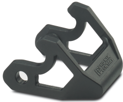
Replacement latch for HC-D7 housing

Please be informed that the data shown in this PDF Document is generated from our Online Catalog. Please find the complete data in the user's documentation. Our General Terms of Use for Downloads are valid ( http://phoenixcontact.com/download )