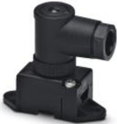
AS-Interface distributor with IP67 protection for 1 flat-ribbon conductor, 2-pos., with screw connection, angled

Please be informed that the data shown in this PDF Document is generated from our Online Catalog. Please find the complete data in the user's documentation. Our General Terms of Use for Downloads are valid ( http://phoenixcontact.com/download )