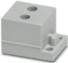
Small, slotted cable sleeves suitable for two cables with a diameter of 4 ... 5 mm, material: SEBS

Please be informed that the data shown in this PDF Document is generated from our Online Catalog. Please find the complete data in the user's documentation. Our General Terms of Use for Downloads are valid ( http://phoenixcontact.com/download )