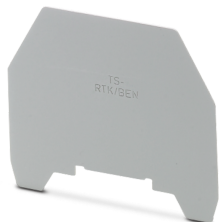
Separating plate, length: 61 mm, width: 0.8 mm, color: gray

Please be informed that the data shown in this PDF Document is generated from our Online Catalog. Please find the complete data in the user's documentation. Our General Terms of Use for Downloads are valid ( http://phoenixcontact.com/download )