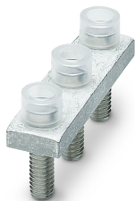
Fixed bridge, pitch: 20 mm, color: silver

Please be informed that the data shown in this PDF Document is generated from our Online Catalog. Please find the complete data in the user's documentation. Our General Terms of Use for Downloads are valid ( http://phoenixcontact.com/download )