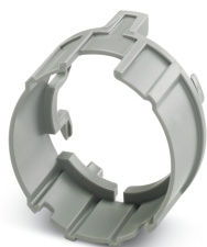
Installation connector, Range of articles: PRC 35, Color-coding, housing material: PA 6.6-FR, color: gray

Please be informed that the data shown in this PDF Document is generated from our Online Catalog. Please find the complete data in the user's documentation. Our General Terms of Use for Downloads are valid ( http://phoenixcontact.com/download )