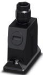
HEAVYCON ADVANCE B16 sleeve housing, with screw locking (Allen screw), plastic, height: 100 mm, with 1 x M40 thread, straight cable outlet

Please be informed that the data shown in this PDF Document is generated from our Online Catalog. Please find the complete data in the user's documentation. Our General Terms of Use for Downloads are valid ( http://download.phoenixcontact.com )