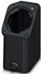
HEAVYCON EVO sleeve housing, plastic, with bayonet flange for EVO screw connection, B10, for single locking latch, height: 87.5 mm, without EVO screw connection

Please be informed that the data shown in this PDF Document is generated from our Online Catalog. Please find the complete data in the user's documentation. Our General Terms of Use for Downloads are valid ( http://download.phoenixcontact.com )