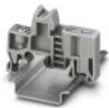
End clamp, for assembly on NS 32 or NS 35/7.5 DIN rail