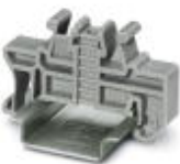
Snap-on end bracket, for 35 mm NS 35/7.5 or NS 35/15 DIN rail, can be fitted with Zack strip ZB 8 and ZB 8/27, terminal strip marker KLM 2 and KLM, width: 9.5 mm, color: gray