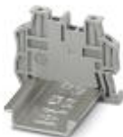
Quick mounting end clamp for NS 35/7,5 DIN rail or NS 35/15 DIN rail, can be fitted with ZB 5 and ZBF 5 zack marker strip, KLM 2, KLM3, and KML3L terminal strip marker, parking option for FBS...5, FBS...6, KSS 5, KSS 6, width: 5.15 mm, color: gray