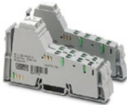
Inline power terminal block, without accessories, without fuse, 230 V AC

Please be informed that the data shown in this PDF Document is generated from our Online Catalog. Please find the complete data in the user's documentation. Our General Terms of Use for Downloads are valid ( http://phoenixcontact.com/download )