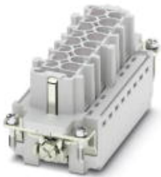
HEAVYCON socket insert, for 830 V (III/3), with 6 N/O contacts and 2 switch contacts, crimp connection

Please be informed that the data shown in this PDF Document is generated from our Online Catalog. Please find the complete data in the user's documentation. Our General Terms of Use for Downloads are valid ( http://phoenixcontact.com/download )