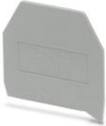
End cover, Length: 43 mm, Width: 1.5 mm, Color: gray

Please be informed that the data shown in this PDF Document is generated from our Online Catalog. Please find the complete data in the user's documentation. Our General Terms of Use for Downloads are valid ( http://phoenixcontact.com/download )