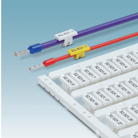
Figure may contain other products.