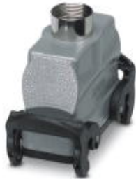
HEAVYCON B16 coupling housing, with double locking latch, height: 82 mm, with 1 x M32 gland, straight cable outlet

Please be informed that the data shown in this PDF Document is generated from our Online Catalog. Please find the complete data in the user's documentation. Our General Terms of Use for Downloads are valid ( http://download.phoenixcontact.com )