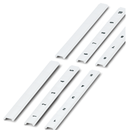
Zack marker strip, 10-section, horizontally labeled with the consecutive numbers: 81 ... 90, white, for terminal block width: 10 mm

Please be informed that the data shown in this PDF Document is generated from our Online Catalog. Please find the complete data in the user's documentation. Our General Terms of Use for Downloads are valid ( http://phoenixcontact.com/download )