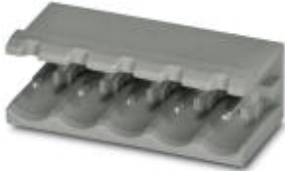
The figure shows a 5-pos. version of the product in gray

Header, Nominal current: 12 A, Rated voltage (III/2): 320 V, Number of positions: 12, Pitch: 5.08 mm, Color: pastel green, Contact surface: Tin, Assembly: Soldering