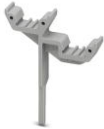
Double marker carrier, snaps onto the double-level spring-cage terminal block STTB 2.5 and STTB 4, labeled with ZB 5 or ZBF 5

Please be informed that the data shown in this PDF Document is generated from our Online Catalog. Please find the complete data in the user's documentation. Our General Terms of Use for Downloads are valid ( http://download.phoenixcontact.com )