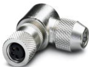
Sensor/actuator connector, socket, angled, 4-pos., M8, shielded, solder connection, metal knurl, cable diameter max. 5 mm

Please be informed that the data shown in this PDF Document is generated from our Online Catalog. Please find the complete data in the user's documentation. Our General Terms of Use for Downloads are valid ( http://download.phoenixcontact.com )