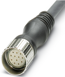
Socket M23, straight, 12-pos., with 20 m master cable

Please be informed that the data shown in this PDF Document is generated from our Online Catalog. Please find the complete data in the user's documentation. Our General Terms of Use for Downloads are valid ( http://phoenixcontact.com/download )