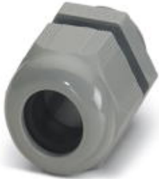
Cable gland, Cable gland material: Polyamide 6, External cable diameter 34 mm ... 44 mm, Shielding: No, Connecting thread: Pg48

Please be informed that the data shown in this PDF Document is generated from our Online Catalog. Please find the complete data in the user's documentation. Our General Terms of Use for Downloads are valid ( http://phoenixcontact.com/download )