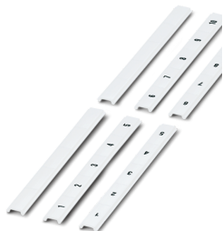
Zack marker strip, 10-section, horizontally labeled with the consecutive numbers: 61 ... 70, white, for terminal block width: 10 mm

Please be informed that the data shown in this PDF Document is generated from our Online Catalog. Please find the complete data in the user's documentation. Our General Terms of Use for Downloads are valid ( http://phoenixcontact.com/download )