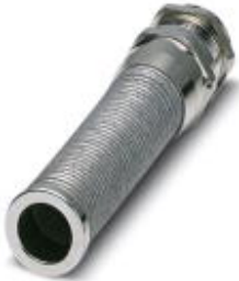
Cable gland, Cable gland material: Nickel-plated brass, Application: Standard, External cable diameter 13 mm ... 21 mm, Shielding: No, Connecting thread: M32, Color: silver

Please be informed that the data shown in this PDF Document is generated from our Online Catalog. Please find the complete data in the user's documentation. Our General Terms of Use for Downloads are valid ( http://phoenixcontact.com/download )