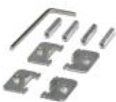
HMI mounting kit for installation on a front plate. The mounting kit includes 4 x mounting brackets, 4 x screw threads, and a hexagonal wrench.

Mounting material - HMI SCB MOUNTING KIT 4 - 2701384