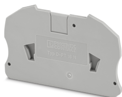
End cover, length: 75.4 mm, width: 2.2 mm, height: 45.6 mm, color: gray

Please be informed that the data shown in this PDF Document is generated from our Online Catalog. Please find the complete data in the user's documentation. Our General Terms of Use for Downloads are valid ( http://phoenixcontact.com/download )