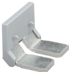
Insertion bridge, pitch: 36 mm, color: gray

Please be informed that the data shown in this PDF Document is generated from our Online Catalog. Please find the complete data in the user's documentation. Our General Terms of Use for Downloads are valid ( http://phoenixcontact.com/download )