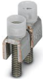
Fixed bridge, Number of positions: 2, Color: silver

Please be informed that the data shown in this PDF Document is generated from our Online Catalog. Please find the complete data in the user's documentation. Our General Terms of Use for Downloads are valid ( http://download.phoenixcontact.com )