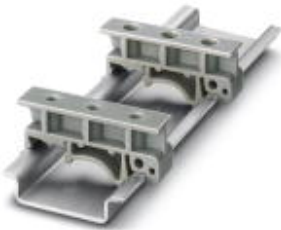
Rail adapters, Width: 10 mm, Height: 19 mm, Length: 42.6 mm, Color: gray

Please be informed that the data shown in this PDF Document is generated from our Online Catalog. Please find the complete data in the user's documentation. Our General Terms of Use for Downloads are valid ( http://download.phoenixcontact.com )