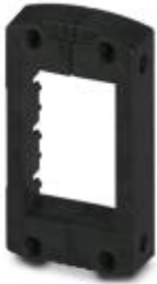
Sealing frame with screw locking, size B10, with flat gasket, for 6 small sleeves

Please be informed that the data shown in this PDF Document is generated from our Online Catalog. Please find the complete data in the user's documentation. Our General Terms of Use for Downloads are valid ( http://phoenixcontact.com/download )